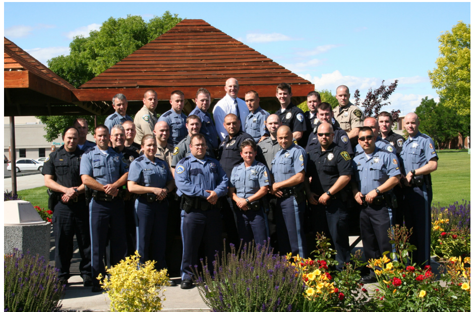
2010 DRE School Treasure Valley Community College Ontario, Oregon