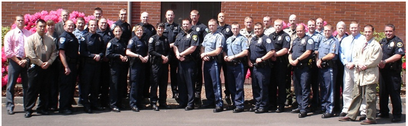
Oregon DRE Class #16 May 2008 Monmouth, OR

During 2008, Oregon conducted one DRE school, training a total of 24 officers as Drug Recognition Experts (DREs). The school was held in May at the Oregon Military Academy in Monmouth. The training included 6 troopers from the Oregon State Police, 15 officers from city police departments, and 3 sheriff's deputies. All 24 officers successfully completed the school. The certification phase was held in Portland, Oregon. During the certification phase, 150 DRE evaluations were completed.