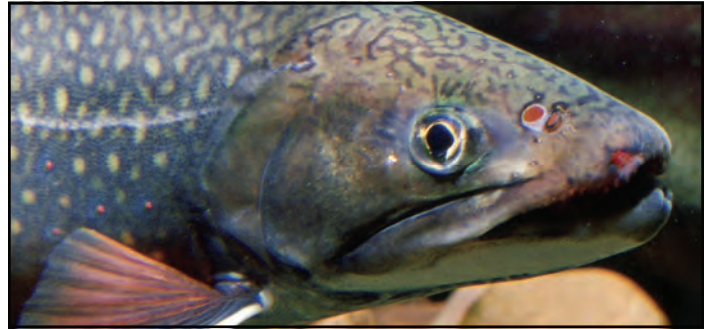
Brook trout.