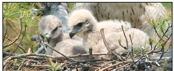
Red-tailed hawk chicks.

Tpr. Boyd (Springfield) finished an investigation of a taxidermist. Boyd cited the taxidermist for No 2009 Taxidermy License and Fail to Maintain Proper Taxidermy Records. The taxidermist was allowed a few weeks to come into compliance on the records but failed to account for everything requested. However, a follow-up with some of the hunters indicated the taxidermist gave Boyd accurate information and the subject animals appeared to have been legally taken.