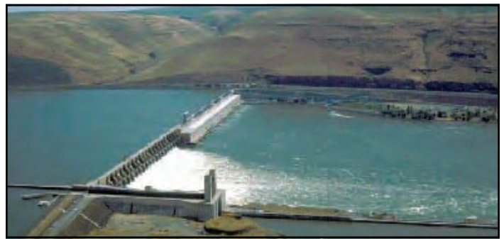
John Day Dam.