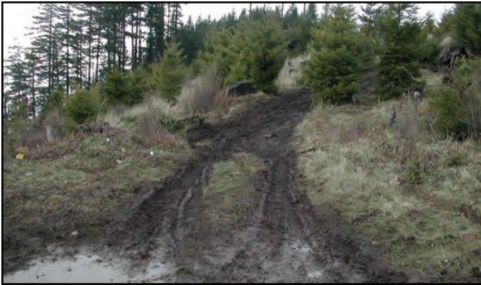
Disrespectful ATV and 4 x 4 operators damage the environment.