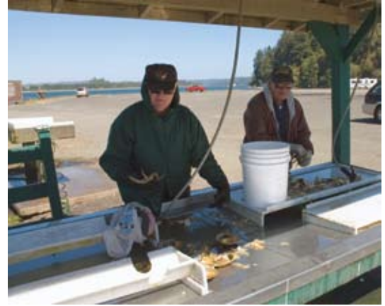
Cleaning crab at Salmon Harbor