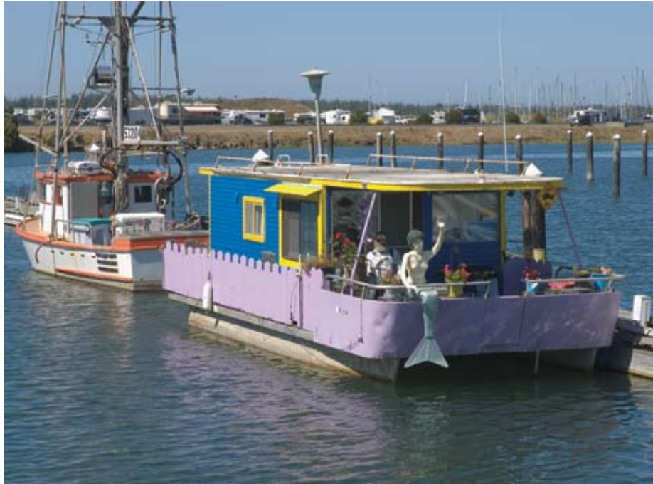
A friendly greeter