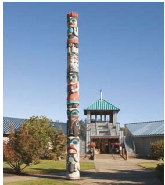
Umpqua Discovery Center in Reedsport's Old Town