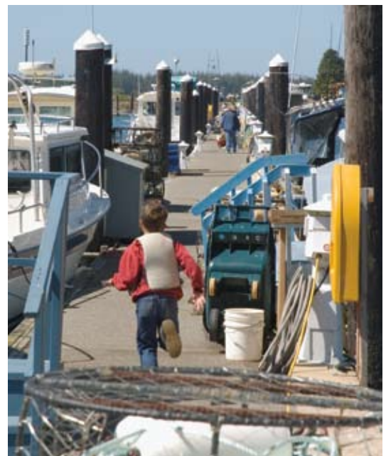
Boy in a hurry at Salmon Harbor Dock

The Umpqua rises in the Cascades and crosses a low Coast Range divide, then tumbles into its estuary through one of the coast's prettiest river canyons. The smaller Smith River converges with the Umpqua at Reedsport. A century ago the Umpqua carried steamers, schooners, barges, log rafts, and tugboats from the sea all the way up to Scottsburg and back. Today most river traffic is recreational, with fishing boats dominating the scene.