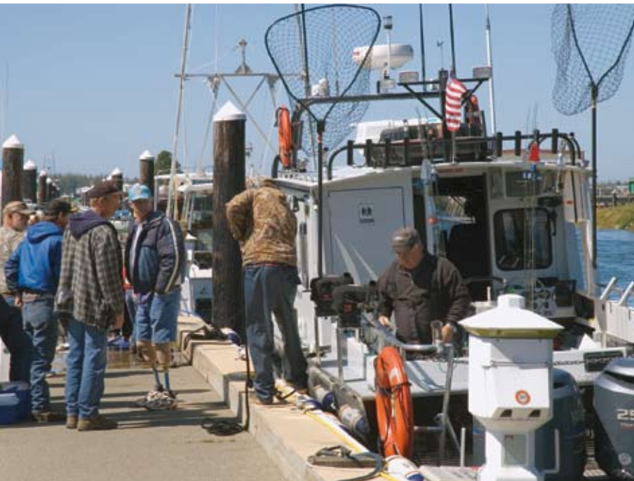
Tying up at Salmon Harbor dock