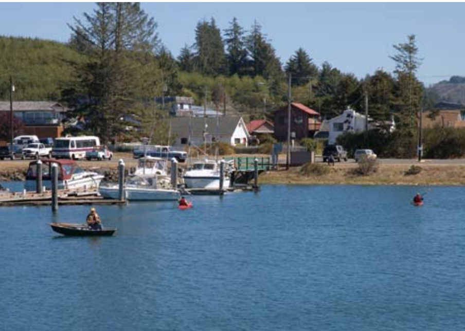
Fishing in Salmon Harbor

Across the channel, few steps from Reedsport Landing, is the Umpqua Discovery Center, with exhibits and dioramas about the history of the native peoples and of later settlement times. Reedsport's Old Town, with shops, galleries, restaurants, and gift shops, is a short walk from the boat landing.