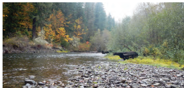
North Fork Middle Fork Willamette River